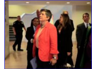
Secretary of Homeland Security Janet Napolitano waits for an elevator on Capitol Hill in Washington Wednesday, July 21, 2010.