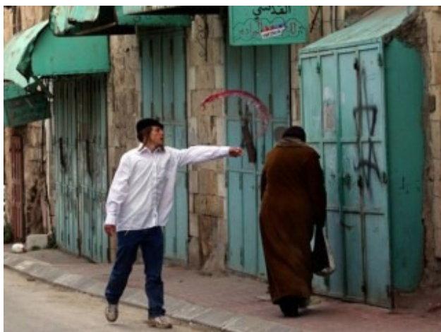
A young Orthodox man insults an Arab woman publicly

Scientific anti-Semitism insisted that the Jews were different from Christian Europeans. Indeed that the Jews were not European at all and that their very presence in Europe is what causes anti-Semitism.