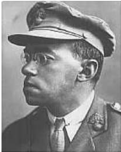
Zev Vladimir Jabotinsky

The United States and European countries, including Germany, would continue the pro-Zionist policies of the Nazis. Post-War West German governments that presented themselves as opening a new page in their relationship with Jews in reality did no such thing.