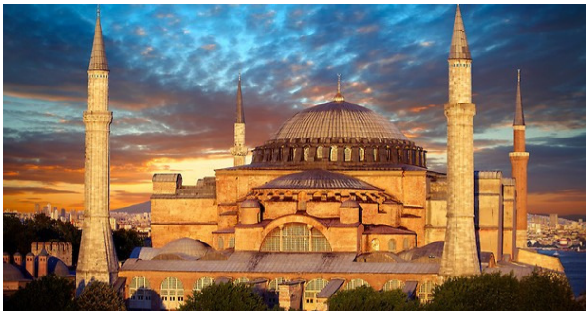
Hagia Sophia – Istanbul